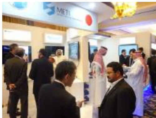
Workshop about “Japanese Desalination Technologies” for SAWEA