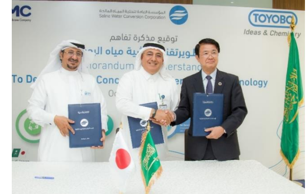
The joint project of pilot test on Brine Concentration membrane technology for brine management of seawater desalination