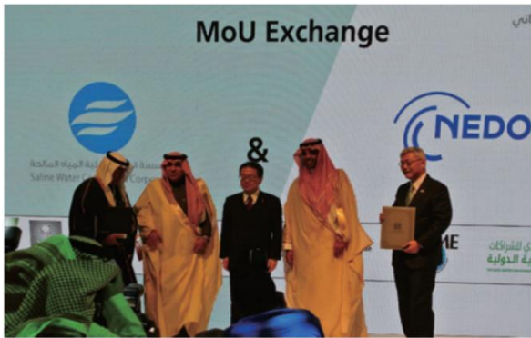
Demonstration Project of Energy Saving Seawater RO System (Megaton Water Project)