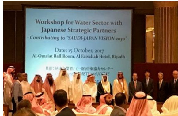
Workshop for Water Sector with Japanese Strategic Partners