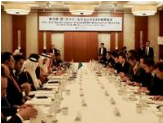
Photos of Ministerial Meetings